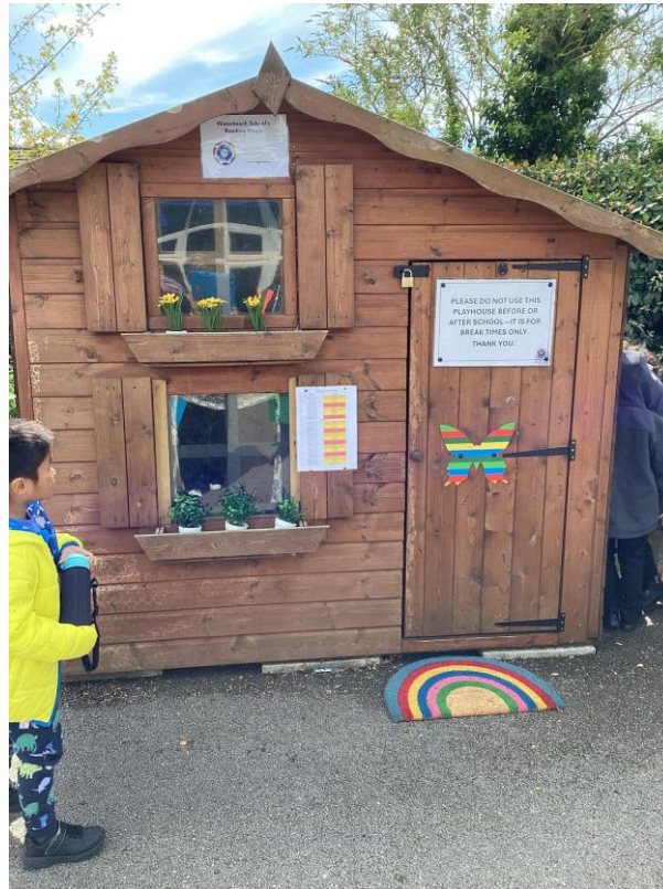
1 - Look at our lovely Reading House.