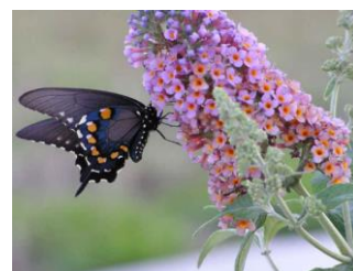
Buddleia (Butterfly tree)