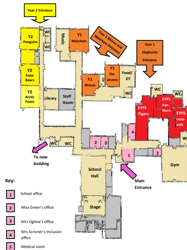
Map of the school KS1 (main building):