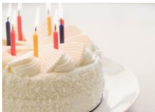
Un gateau – a cake