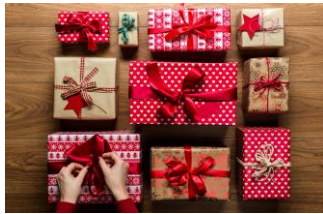
Des cadeaux - presents